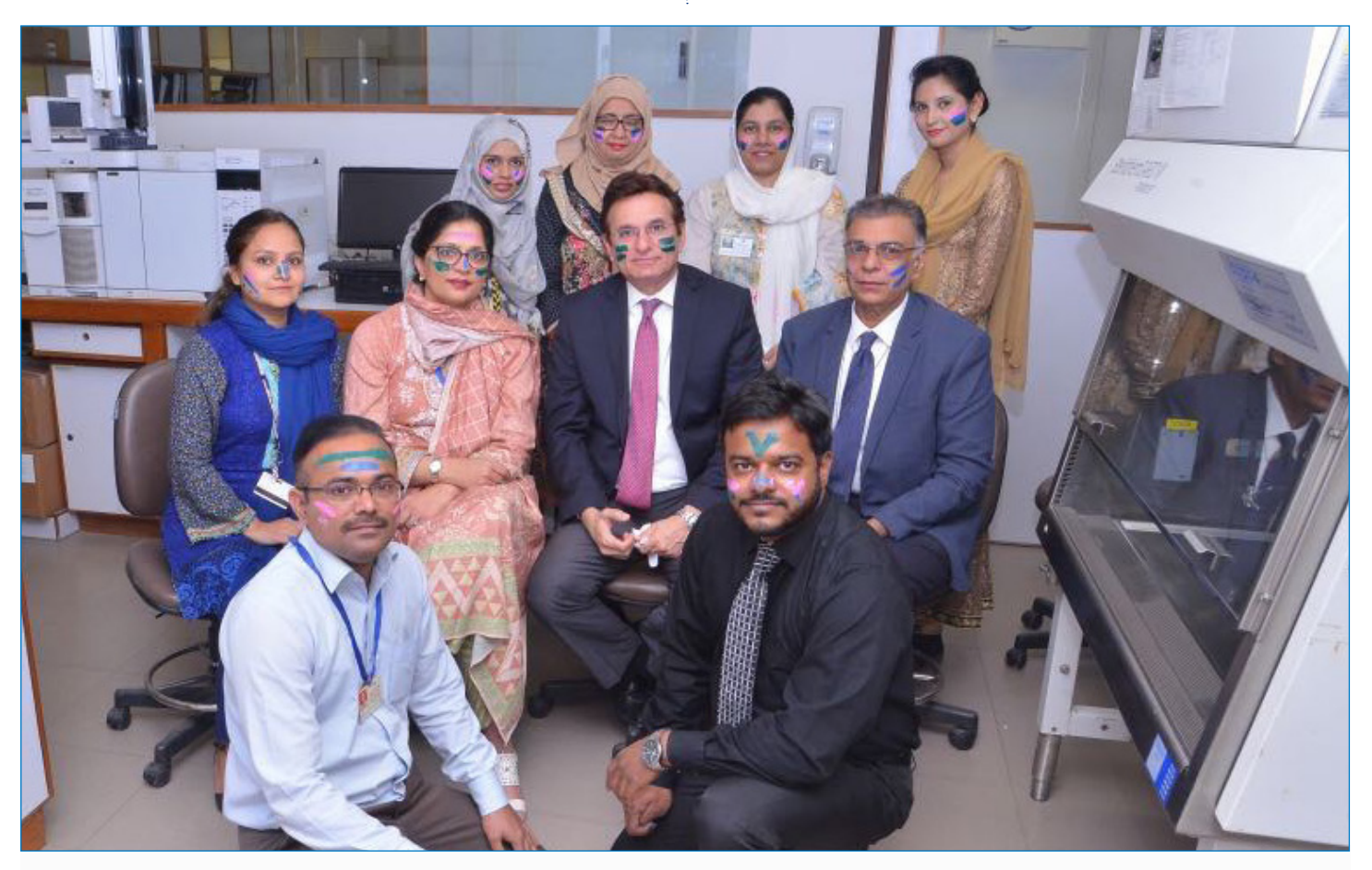
Face-painting social media campaign to raise awareness of rare diseases

A formal refreshment programme followed where participants had a chance to mingle with the experts and share their views.