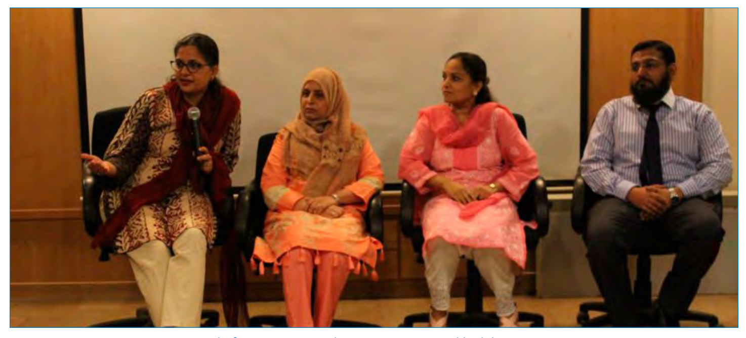
Panel of Experts responding to queries raised by laboratorians