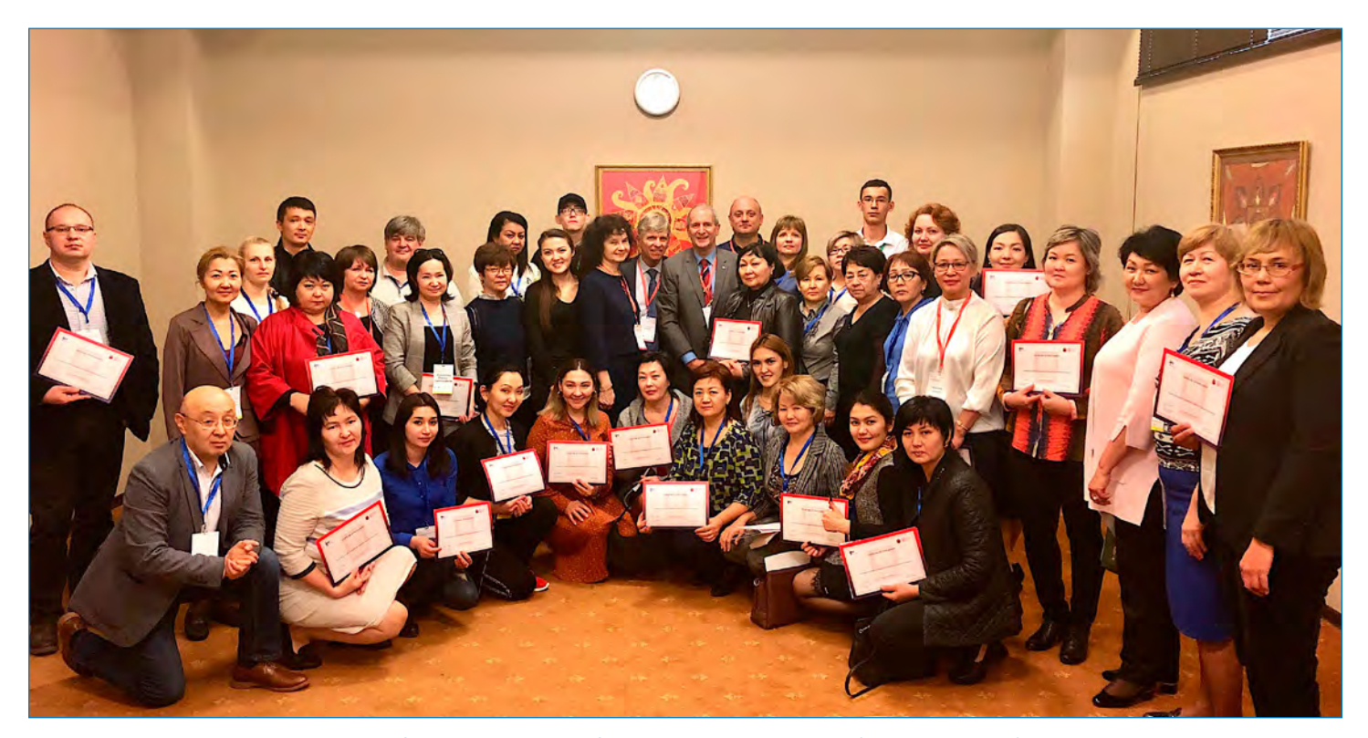
Certificate ceremony of workshop participants (April 20, 2019)

tory service specialists in Kazakhstan".