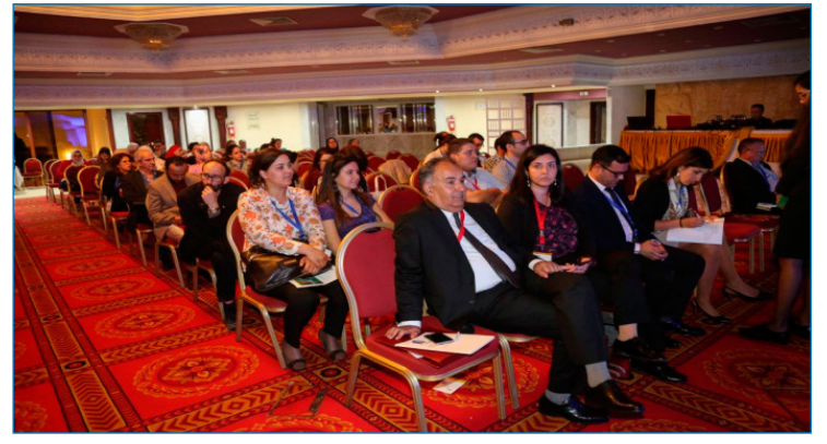
Participants to the IFCC TF YS session "Trends in medical laboratory science"