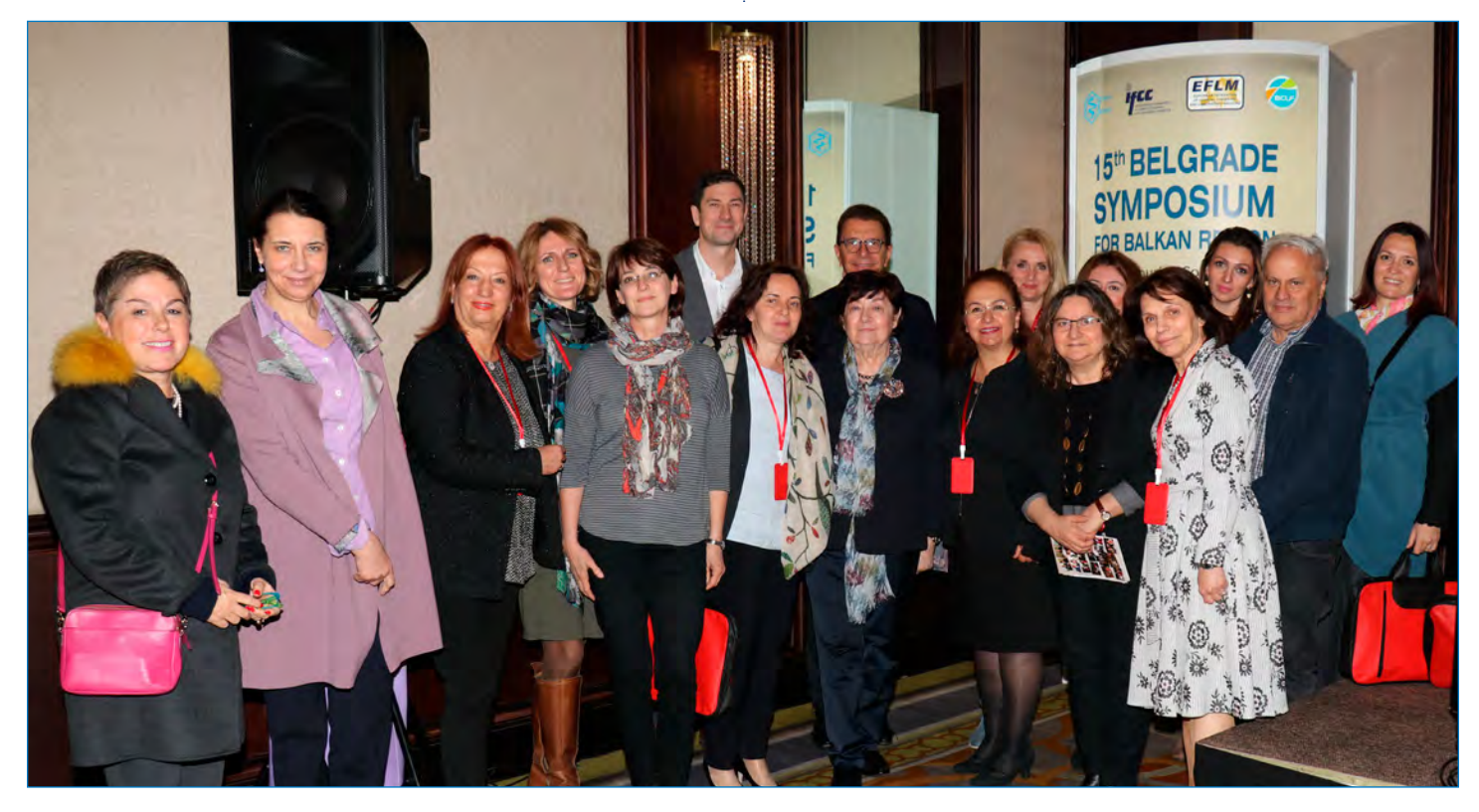
Speakers and chairs of the 15th Belgrade Symposium for Balkan Region

The two day Symposium, with over 250 participants, pointed out the same issues and problems that laboratory medicine professionals in this region meet in their every day work and practice, provoking discussions and exchange of opinion. The positive impressions of all the participants demonstrated that these local meetings addressing the practical issues that we are all facing and exchanging experience are necessary in laboratory medicine practice, and that the local problems are rather common to all than local.