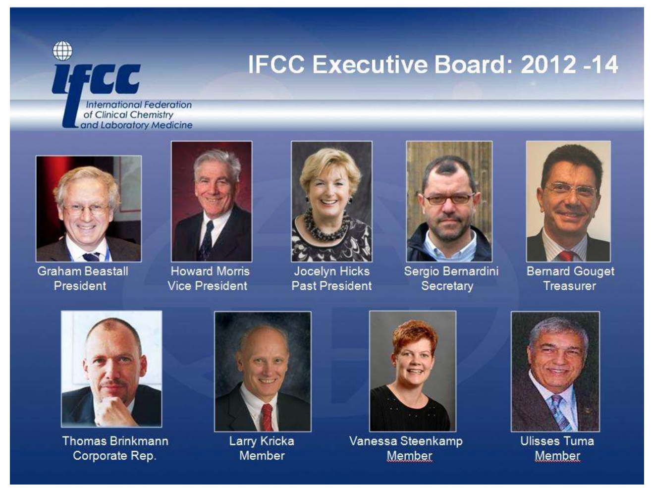
Executive board Members