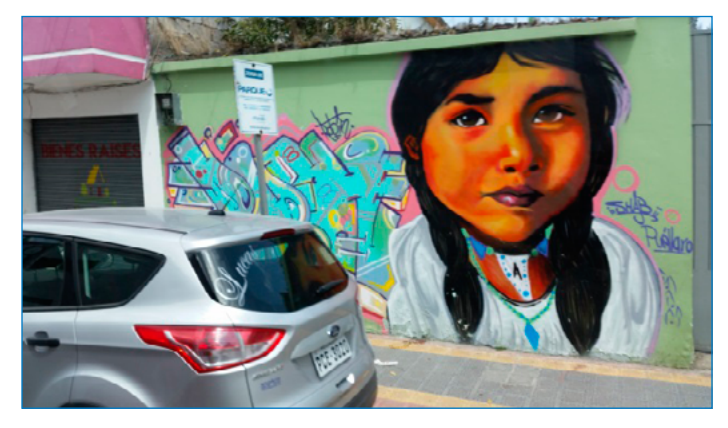
A mural from the streets of Quito