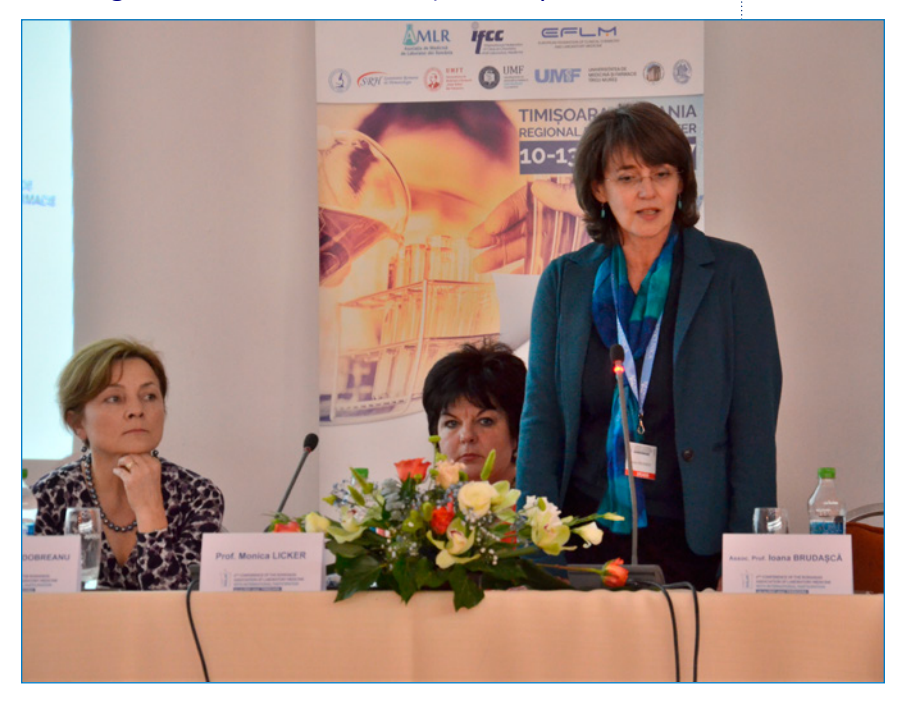
Speakers at 2nd RALM Conference

The congress was attended by over 550 participants (i.e. medical doctors, scientists and lab technicians working in medical laboratories). Four speakers from