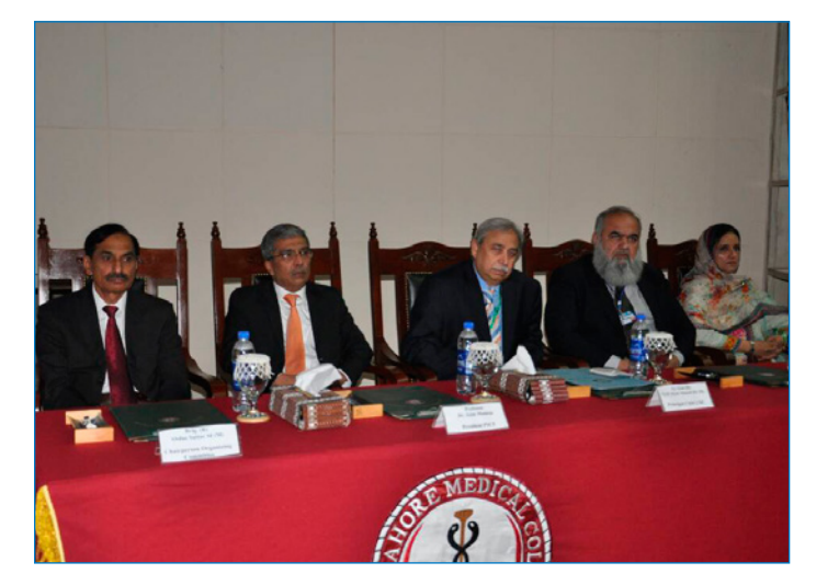
PSCP Executive Council Members