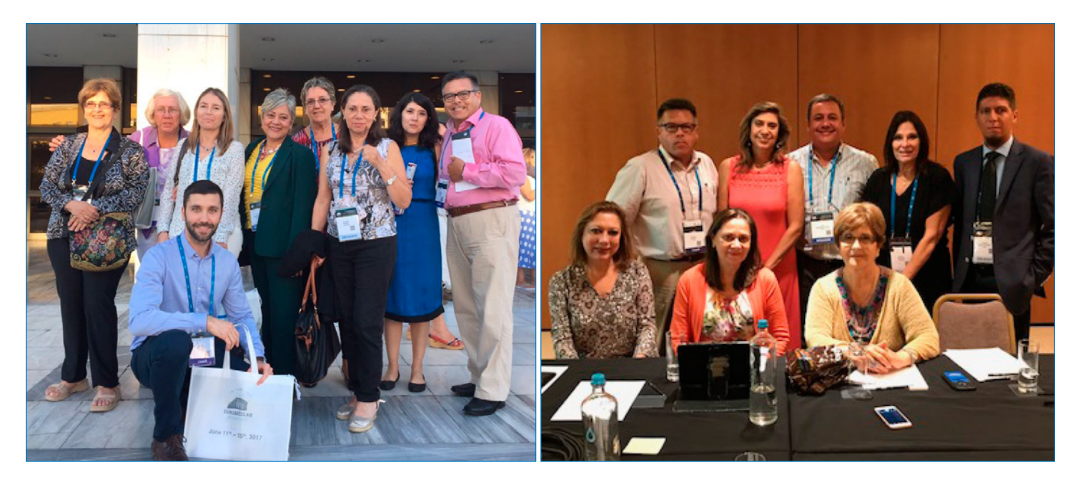
COLABLIOCLI participants Left: at the congress; Right: during the closed meetings