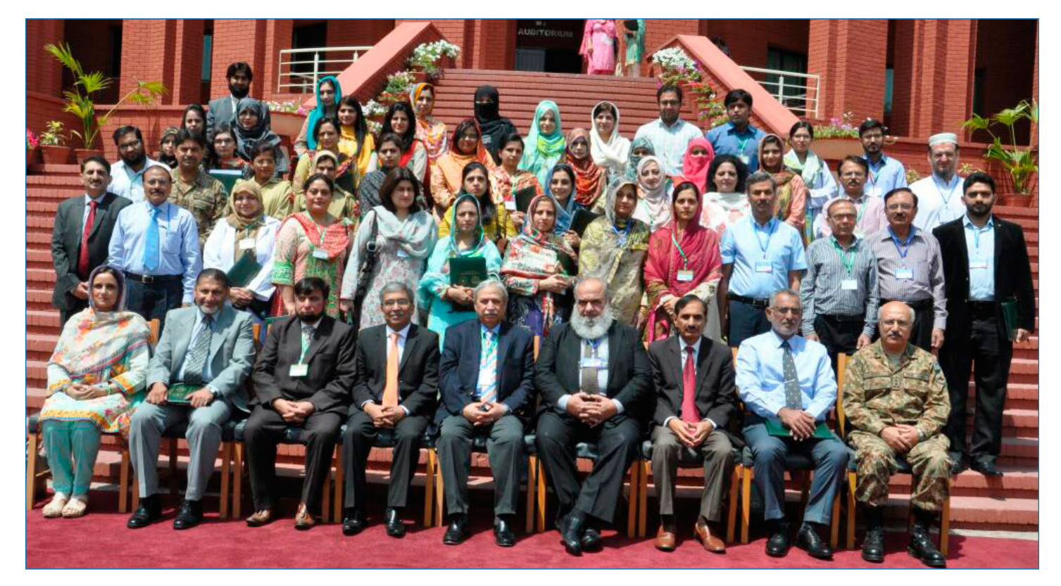
Participants at the 8th Annual PSCP Course