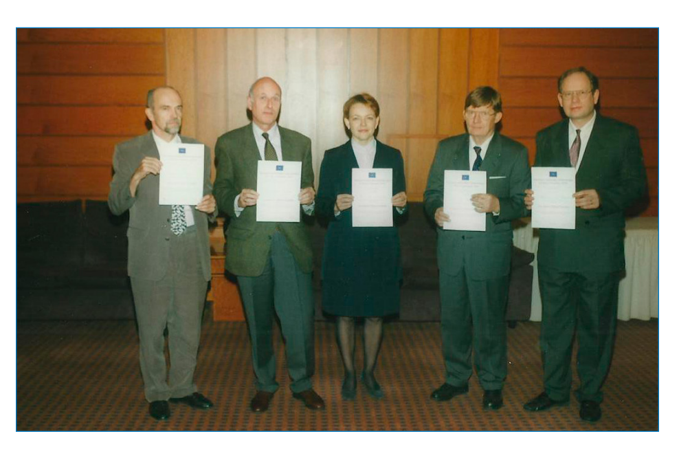
First recipients of EC4 Registration Certificates

While efforts to form FESCC reflected a desire for representation of the geographical continent of Europe,