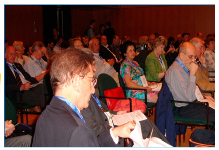
General Assembly delegates