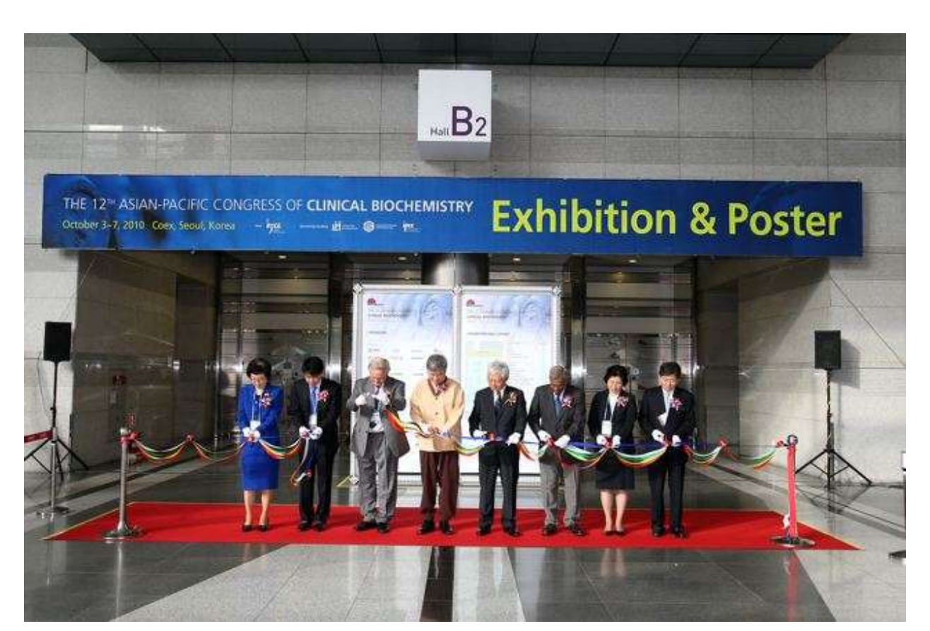
12th Asian-Pacific Congress of Clinical Biochemistry

The results of the 3<sup>rd</sup> Asian Study were presented at a symposium at the 12<sup>th</sup> APCCB in Seoul in October.