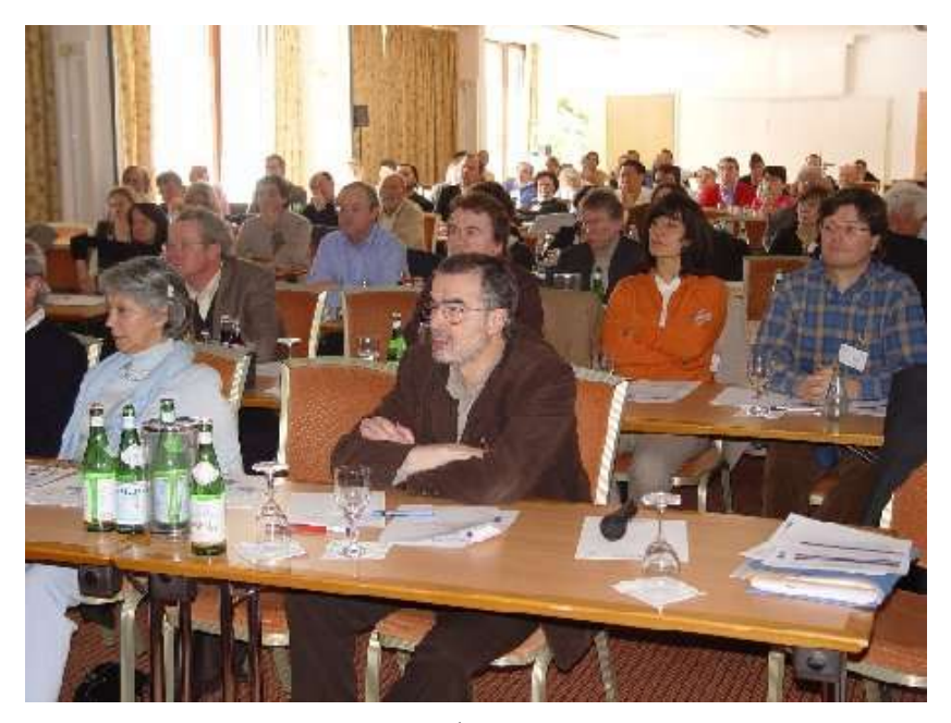
Participants of the 10<sup>th</sup> Bergmeyer Conference

The participants agreed upon the plan of action: