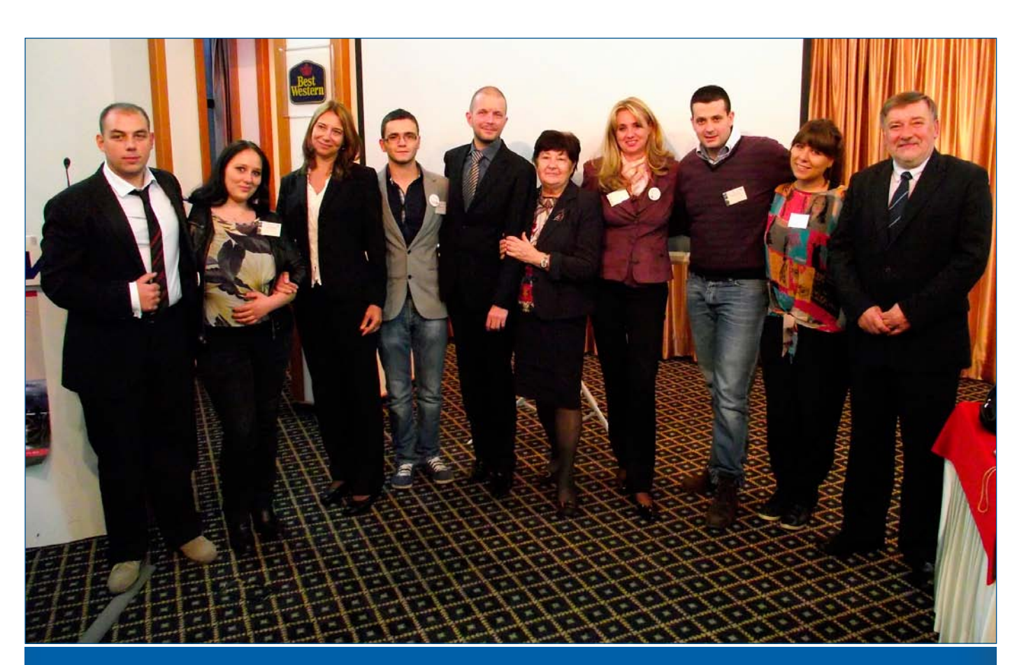
9th EFLM Symposium for Balkan Region

All sections were extremely well attended, and about 250 registered participants and students attended the Symposium. The lectures instigated interesting discussions which completed the overall impression that once again the Society of Medical Biochemists of Serbia organized a successful meeting according to the EFLM standards.