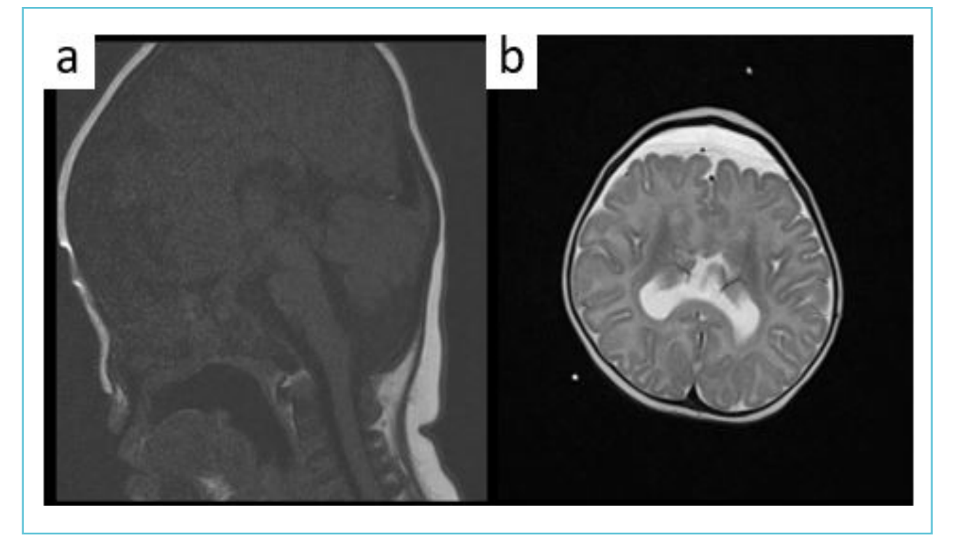
Figure 1Panel a: MRI brain showing absent pituitary bright spotPanel b: Semi-lobar holoprosencephaly

Extreme dehydration can result in hypernatremia, which can lead to neurological symptoms such as seizures, encephalopathy and coma [7,8]. In our case, despite severe hypernatremia (167 mmol/L), the child was asymptomatic.